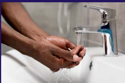
Washing hands frequently when carrying out work

Objective: To help everyone keep good hygiene through the working day.